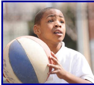
Almost there— help us reach our goal!

Double the impact of your gift by making a donation today!